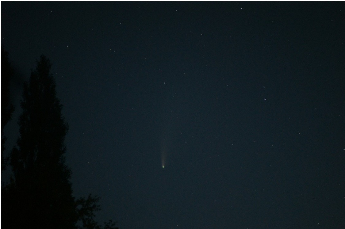
Comet NEOWISE, from Ratts Cottages (July 2020)