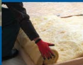
Free loft insulation