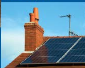
Free solar panels