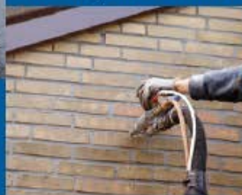
Free cavity wall insulation