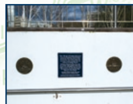
The plaque and tokens at Eastrop Link