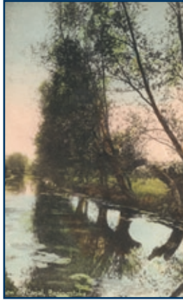
photo card of canal at Eastrop

Look out for scented Meadowsweet and kingfishers on your walk