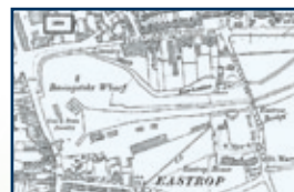
Plan of canal basin 1894