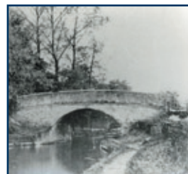
photo card of canal at Eastrop