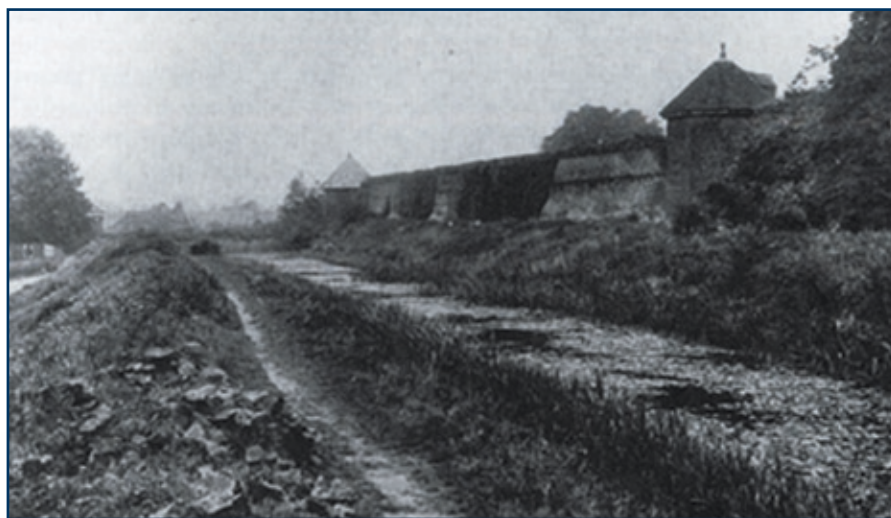
The great wall of Basing House with two of its octagonal dovecotes built, c.1530.

Turn left towards Old Basing village and at The Crown. Continue along the street until you reach the main entrance of Basing House.