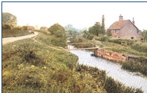
photo card of Swing Bridge Cottages circa 1912

The Limepits contain a large play area and informal space for picnics and relaxation.