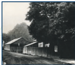
Entrance to Basingstoke Wharf from Wote Street (E.C. White Timber Yard)