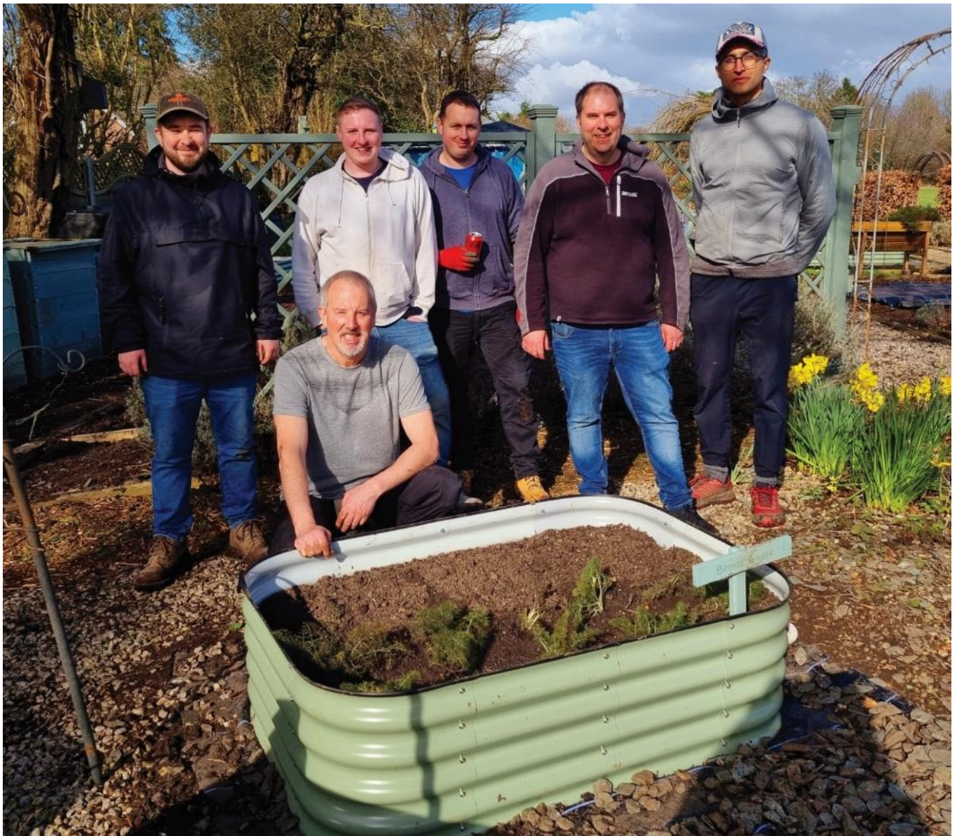
Fujitsu employees on a volunteering day with Inspero

Now in its fourth year, the scheme has so far seen more than 237 grants awarded to community and voluntary organisations to help them deliver small-scale, local initiatives that make a difference to people's lives and bring communities together.