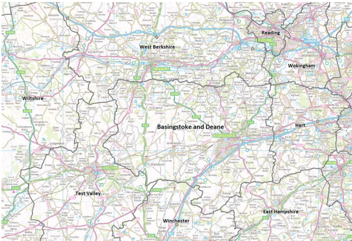
Map 1 - Neighbouring Local Authorities Interviewed