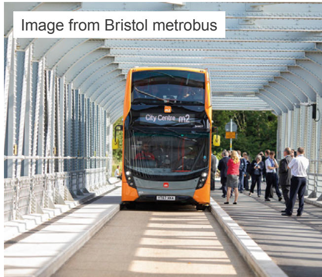
MetroBus in Bristol

Eclipse – Gosport 50% increase in bus passengers in two years