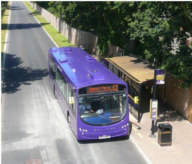
The 'Eclipse' service in Gosport

Bus Rapid Transit schemes are also in place in Crawley, Dartford, Cambridgeshire and Greater Manchester. In 2018 BRT services started in Belfast and Bristol, and BRT is planned for the West Midlands where it will play a key part in providing transport for the Commonwealth Games in 2022.