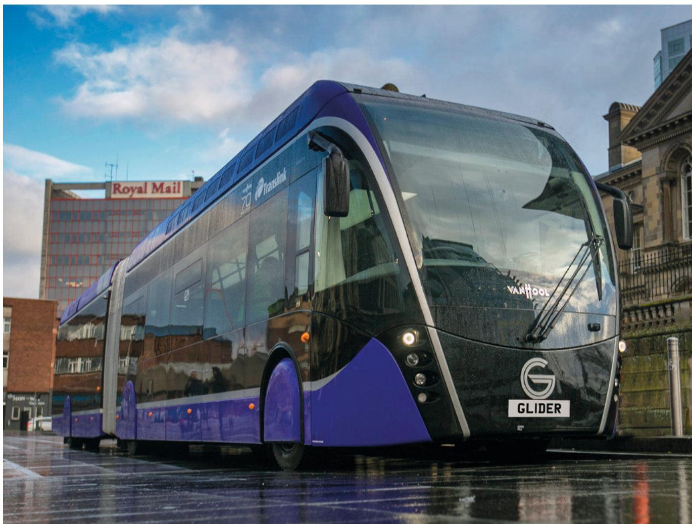
The Glider service in Belfast

MRT would need to work with other parts of the Strategy, including changes to the layout of the town centre and other complementary measures to facilitate MRT.