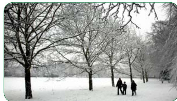
Above; © Photography by Jo Andreae, One World One Camera