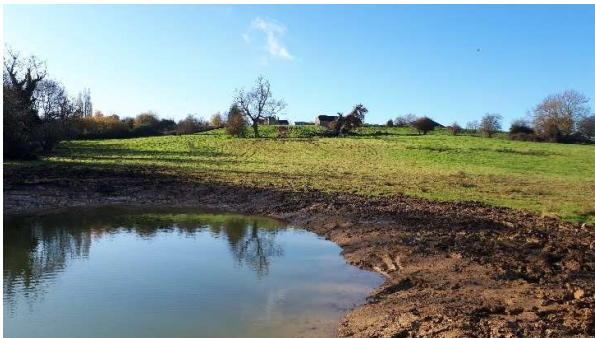
Clean water pond created by the Newt Partnership in 2019