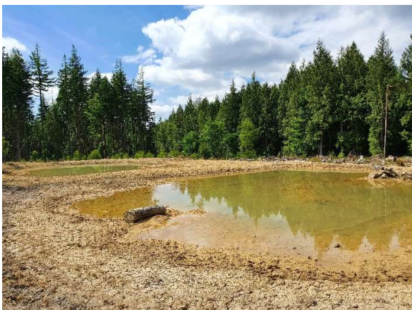
Two clean water ponds created in the Forest of Dean in 2020